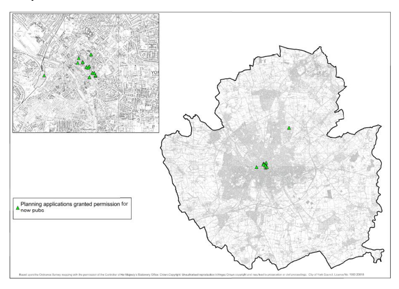
Annex D: Planning applications resulting in the creation of a drinking establishment (use class A4) over the last 10 years